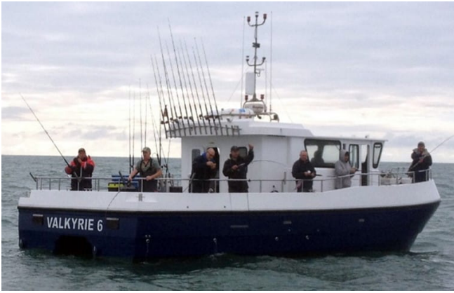
Valkyrie 6 (Bossy Boots Sister Vessel)