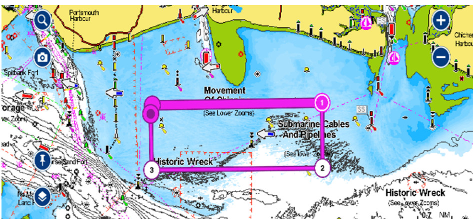
Hayling Bay trials area (Chart not to be used for navigation)